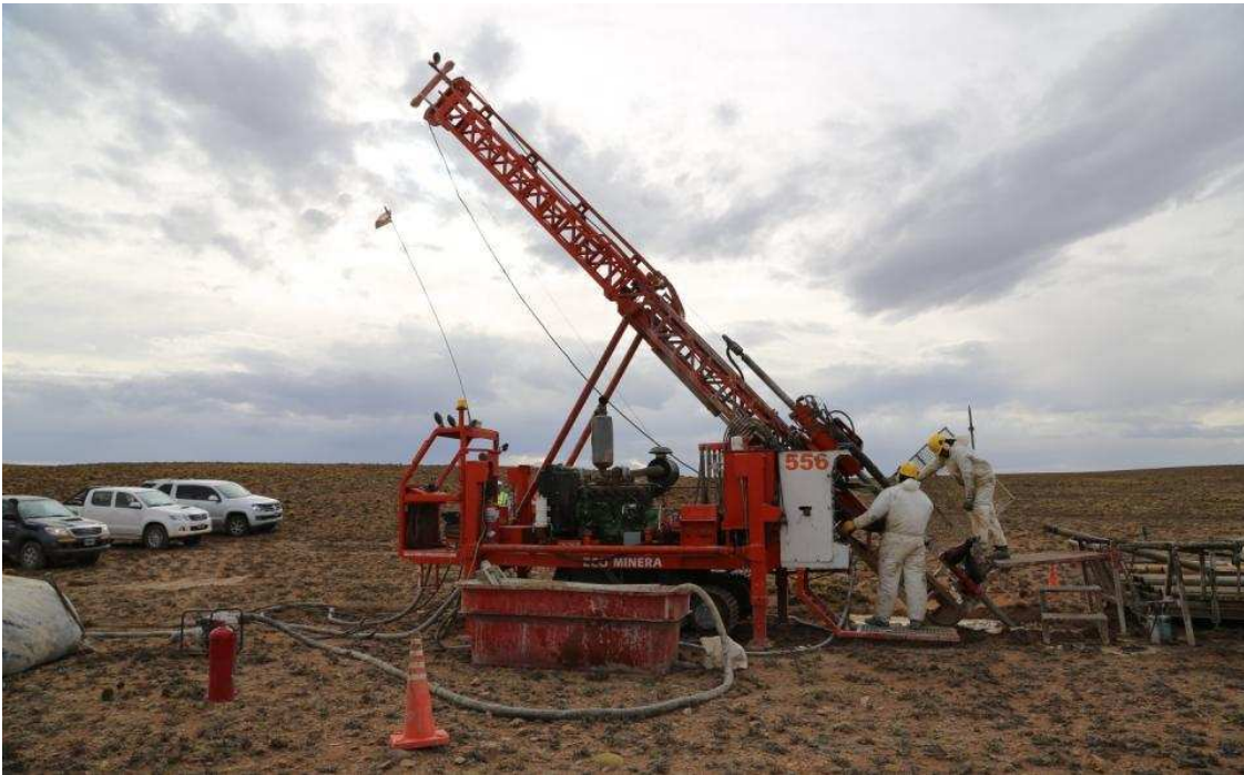
Figure 5: Sterilization drilling at Don Nicolas