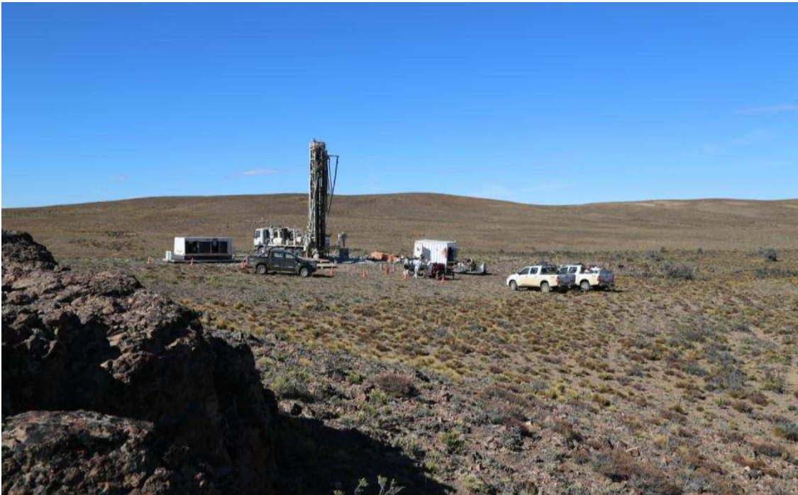
Figure 4: Water Bore drilling at Don Nicolas