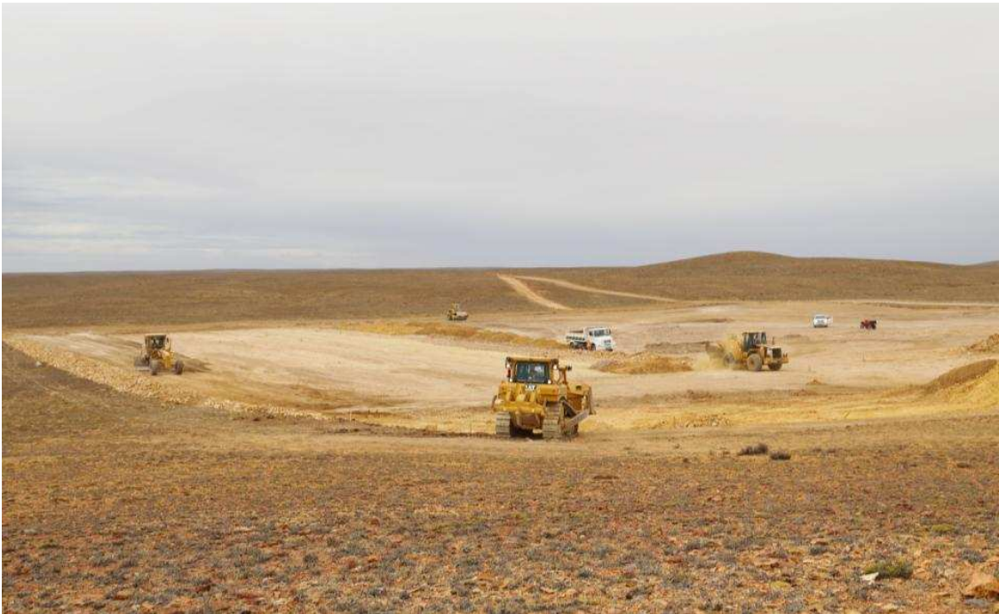
Figure 3: Initial Site Development Underway at Don Nicolas